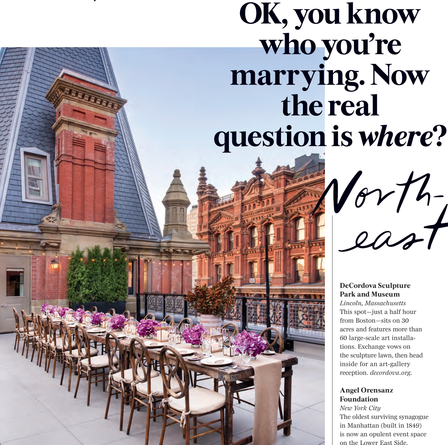
The penthouse terrace of the Beekman, a Thompson Hotel, in New York.

Trust us: Choosing the venue is one of the most important decisions you'll make right about now. Seriously, the location affects almost everything else, from how many people you can invite to what kind of flowers go on the table. Chances are, it's also the biggest chunk of change you've put down, like, ever. So whether you're a city girl who wants a rooftop soirée or the complete opposite of that, here are 28 places in the U.S. where you can gather all your people and get down to celebrating.