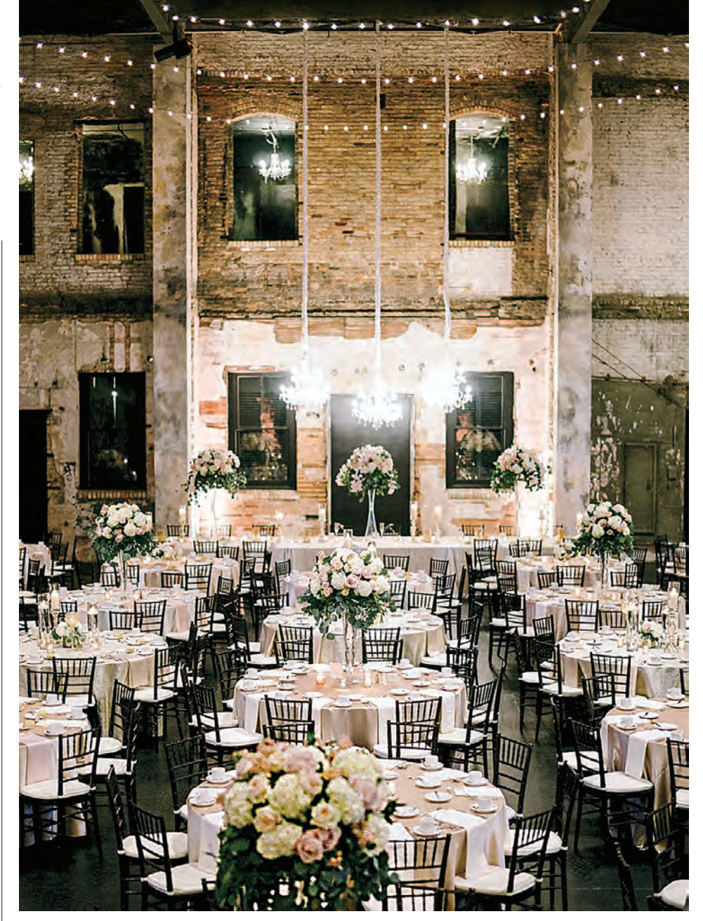
The main room at Aria in Minneapolis is ready for a party of up to 1,000 people.

North Garden, Virginia This winery venue was designed by event planner Lynn Easton with weddings in mind, so your day will flow easily from ceremony (on the lawn) to drinks (on the veranda) to dinner (in the granary). pippinhillfarm.com.